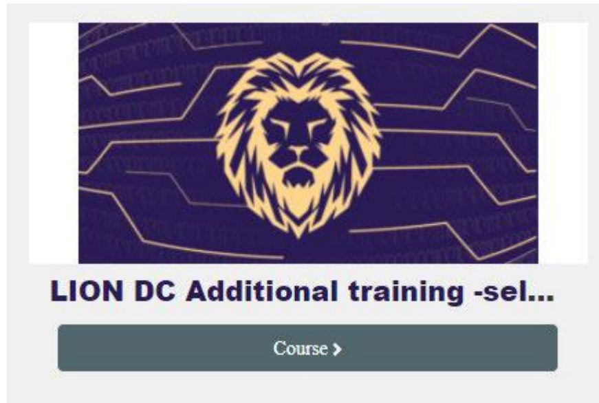
Figure 1: LION DC Additional Training, available through e-learning platform

Based on the success of the previous trainings conducted by LION DC consortium, it was decided after the expression of interest by European LEAs, mainly from Netherlands and Poland to conduct one more "additional" training, based on the last train-the-trainers v2 training. The training was offered to 38 LEA experts. LION DC Additional training took place 3rd May – 25th June, 2021. LEA experts mainly from Netherlands and Polish police had the chance to have a self-paced training and enhance their capabilities on online drug crimes investigation.