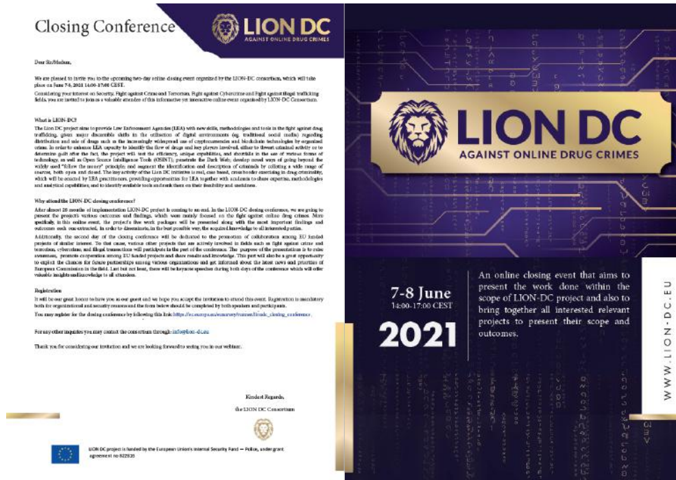
Figure 2: LION DC Closing Conference invitation

In the LION-DC closing conference, the project's various outcomes and findings were presented, which were mainly focused on the fight against online drug crimes. More specifically, in this online event, the project's five work packages were presented along with the most important findings and outcomes each one extracted, in order to disseminate, in the best possible way, the acquired knowledge to all interested parties. Additionally, the second day of the closing conference was dedicated to the promotion of collaboration among EU funded projects of similar interest. To that cause, various other projects that are actively involved in fields such as fight against crime and terrorism, cybercrime, and illegal transactions participated in the part of the conference. The purpose of the presentations was to raise awareness, promote cooperation among EU funded projects and share results and knowledge. This part was also a great opportunity to exploit the chances for future partnerships among various organizations and get informed about the latest news and priorities of European Commission in the field. Keynote speeches were also given during both days of the conference, which offered valuable insights and knowledge to all attendees.